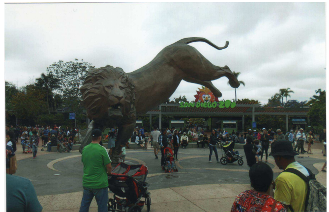
Figure 3 Rex the Lion

Pandas here are geriatric having chewing issues; “eating” 600 lbs daily. Bundles of bamboo pieces 3-4 ft in length consisting of 5 species are fed to the pandas for breakfast, lunch, dinner, and overnight meals. Pandas are picky eaters with an estimated 50% waste. Bamboos of the genus Phyllostachys are considered “broccoli” with those of the genus Bambusa considered ‘ice cream’. Other species are fed to them as well. Pandas also eat fruit and “bread” made of ground bamboo. In the wild pandas live 22-23 years.