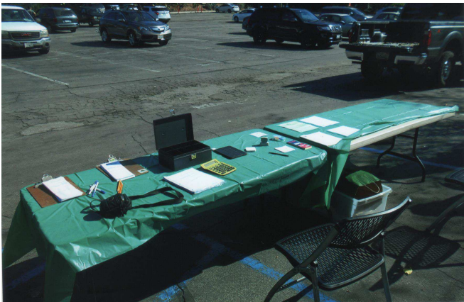
Figure 28 Cashiers tables