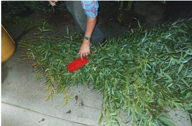
Figure 19 Portion of tagged meal for pandas