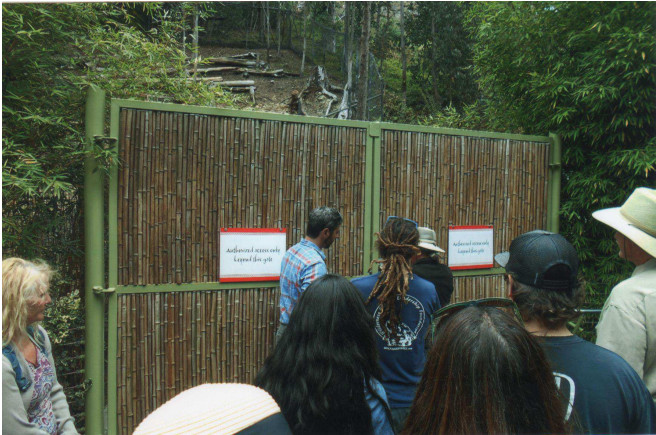
Figure 13 Adam Graves opening back entrance to Panda Exhibit