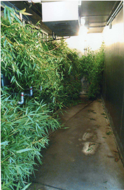
Figure 18 Inside of Bamboo Cooler looking right