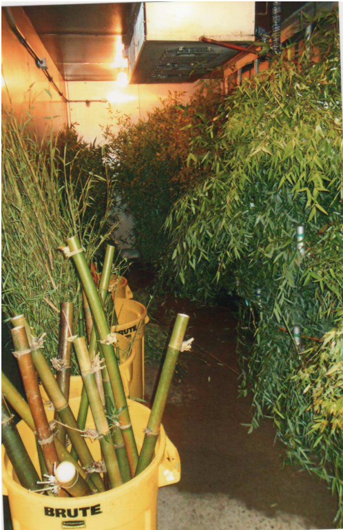
Figure 17 Inside of Bamboo Cooler looking left