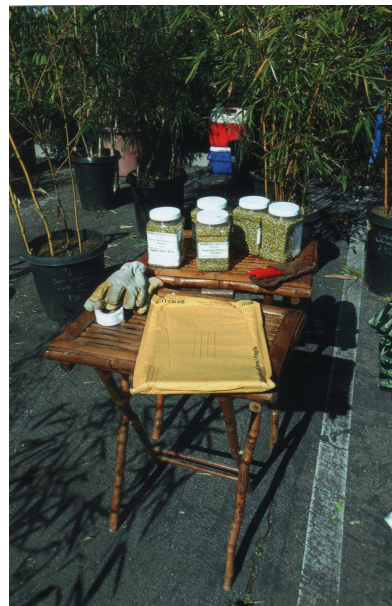
Figure 26 Goods for sale