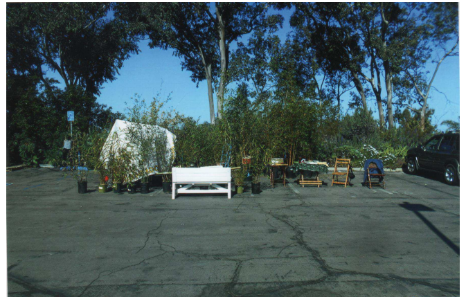
Figure 25 Plants and goods for sale