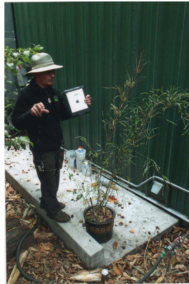
Figure 8 Chusquea circinata