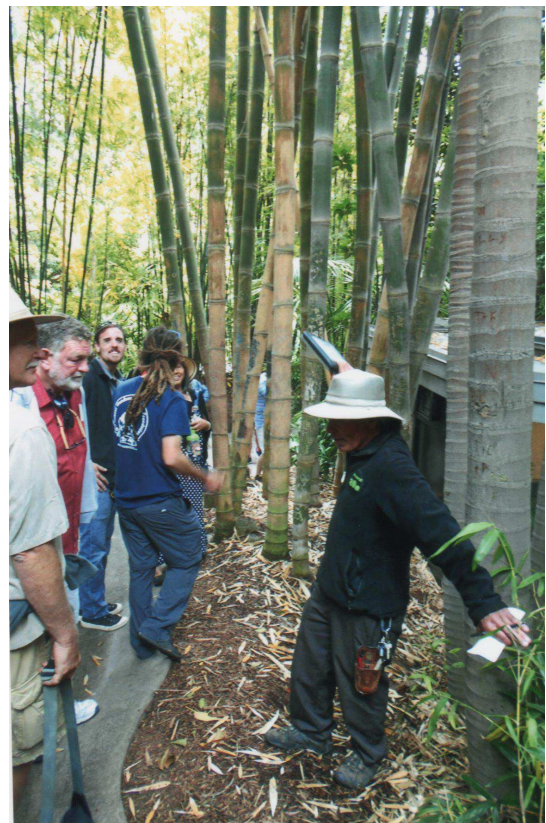
Figure 9 Dendrocalamus asper