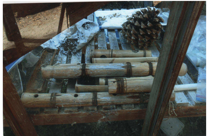
Figure 43 Bamboo Craft inside Hansen Greenhouse at Mt. Baldy Visitor Center (Sept. 2018)

The next ABS (Inter)National Meeting will be in Xalapa, Mexico, just before the World Bamboo Congress begins in August 14th-18th.