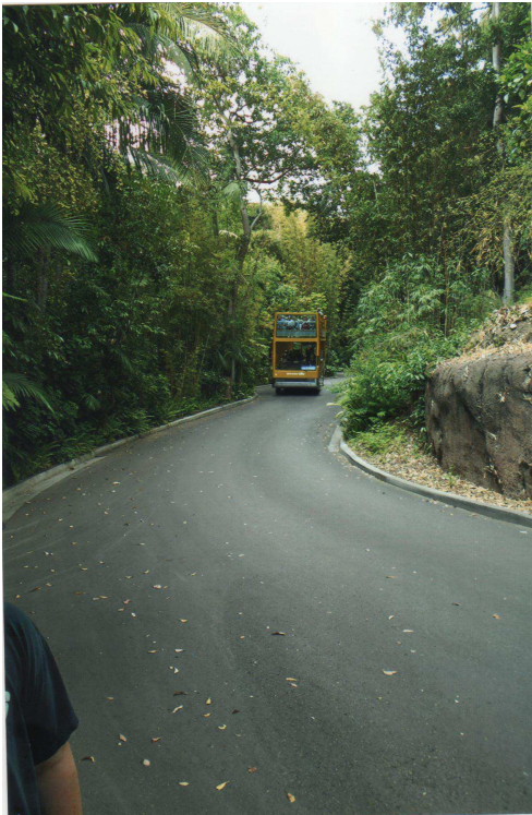
Figure 11 San Diego Zoo Bus