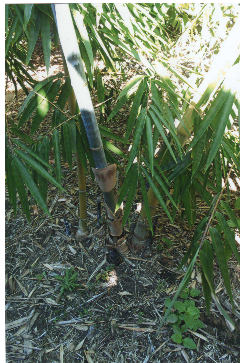
Figure 2 Dendrocalamus giganteus grown from a seed of original plant at then Quail Botanical Gardens (now SDBG). Photographed Sept. 15, 2018.