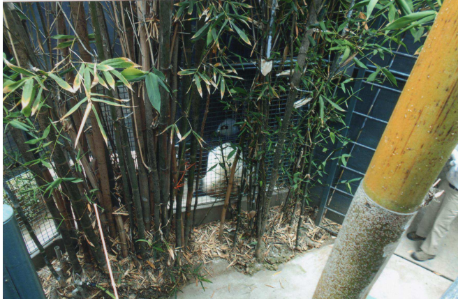
Figure 20 Panda