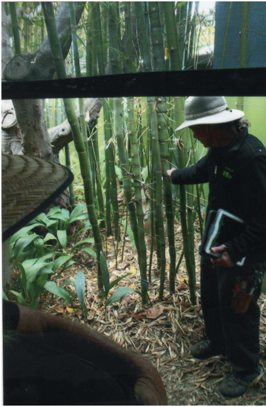
Figure 5 Bambusa ventricosa