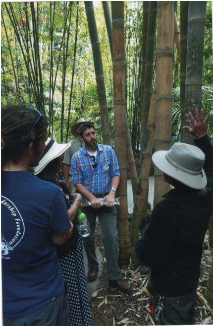
Figure 10 Answering questions