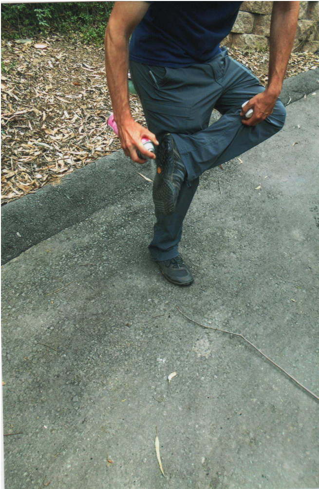
Figure 14 Spraying disinfectant on soles of shoes to protect pandas from diseases