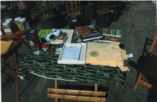
Figure 27 Books for sale