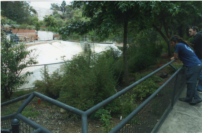
Figure 22 “Cold” section of San Diego Zoo