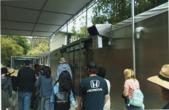
Figure 16 Bamboo Cooler