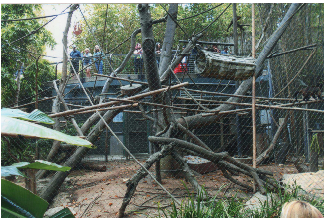
Figure 7 Bamboo Jungle Gym in animal enclosure