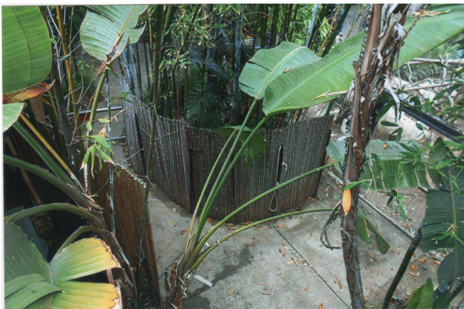
Figure 6 Bamboo Fence