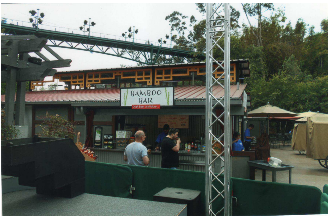
Figure 23 Bamboo signage