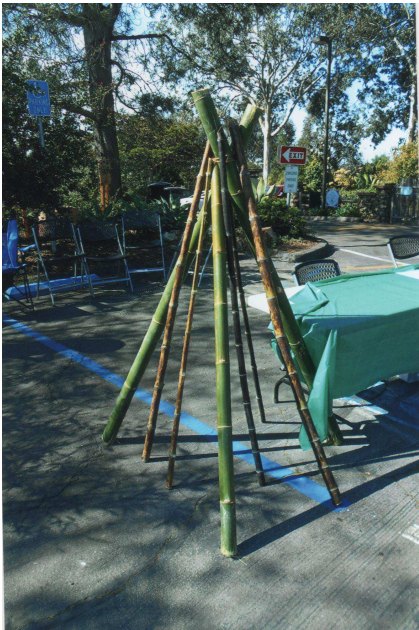
Figure 29 Poles for sale