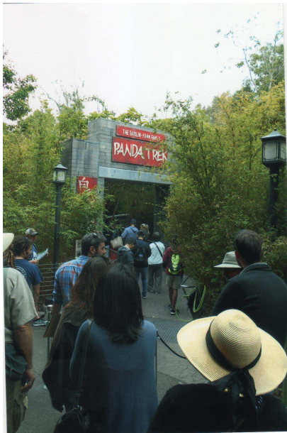
Figure 21 Panda Exhibit entrance