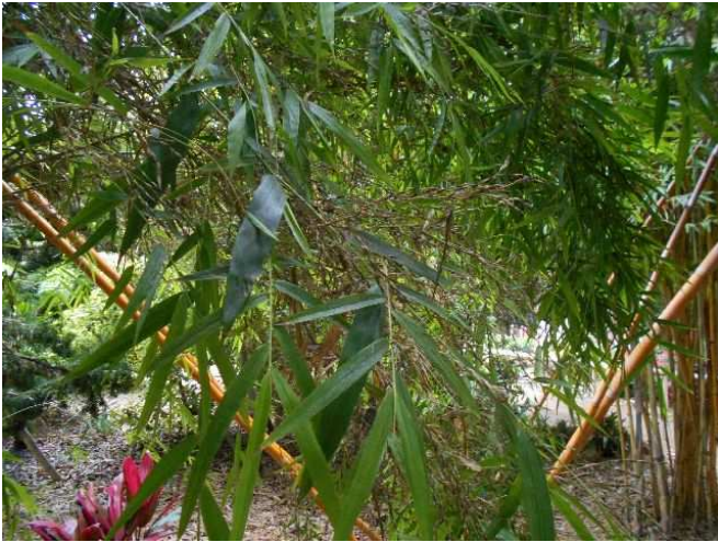
Figure 7 Flowering of Drepanostachyum khasianum