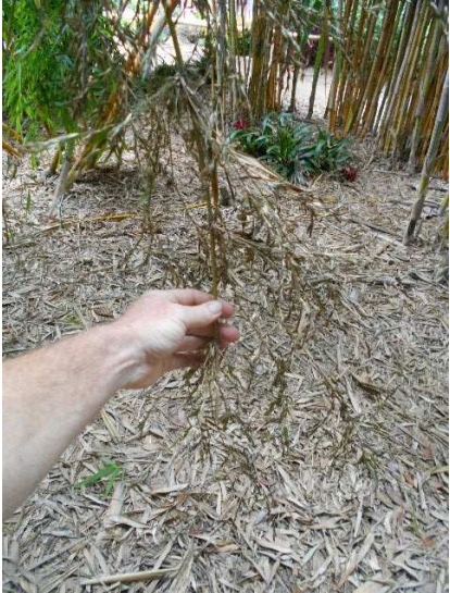
Figure 8 D. khasianum flowers