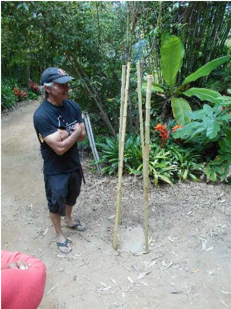
Figure 24 Bamboo poles used to protect an irrigation control box