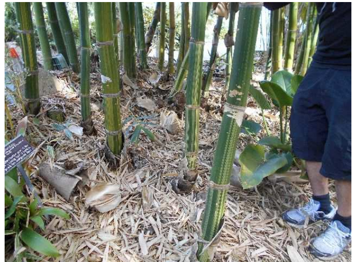
Figure 45 Label lost – Gigantochloa pseudoarundinacea ?