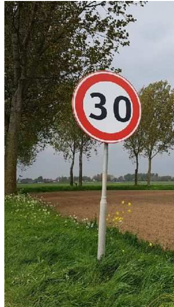
Figure 39 Road sign in Holland made of bamboo. (Speed limit 30 km/h).