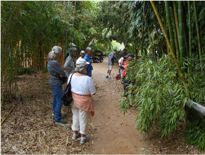
Figure 12 Attendees at Sept. 2017 ABS SoCal event at SDBG