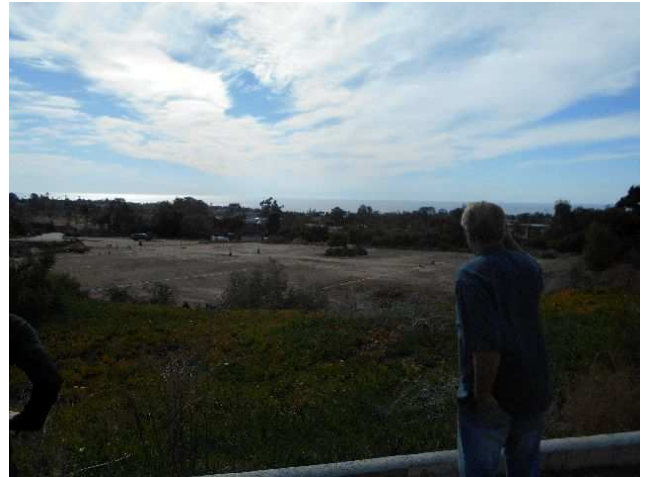
Figure 44 View of Pacific Ocean from SDBG