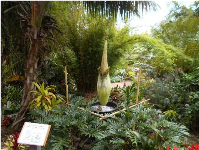
Figure 1 Titan Arum displayed in Bamboo Garden