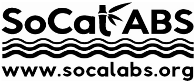
Figure 47 New logo with website