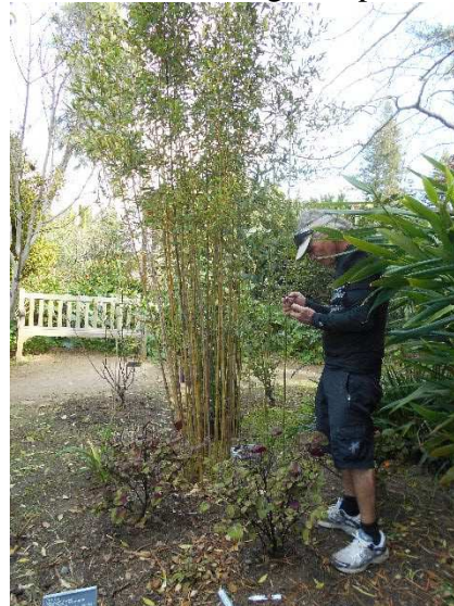
Figure 40 Label lost – Ph. propinqua ?

ABS SoCal held a planning meeting in the Larabee House at SDBG on Feb. 17, 2018. Jeremy Bugarchich Curator of Collections kindly showed us around afterwards on his day off. We looked at the sites of our nursery production and of our upcoming bamboo sale. Landy Banks arrived later due to traffic but signed up 3 new members!