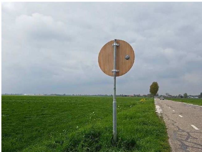
Figure 38 Road sign in Holland made of bamboo.

With this is it extremely suitable for exterior applications. The test with the bamboo road signs is a good practical test for the material that forms a durable alternative for the much used aluminum, thus Moso.