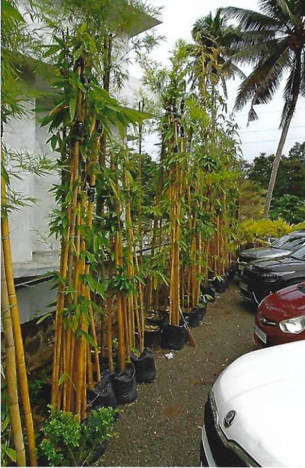
Figure 24 Bamboo at Chris Bottle Crafters