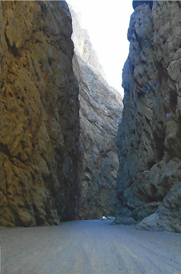
Figure 13 Wadi Tayyb-Esm, Saudi Arabia October 2022.