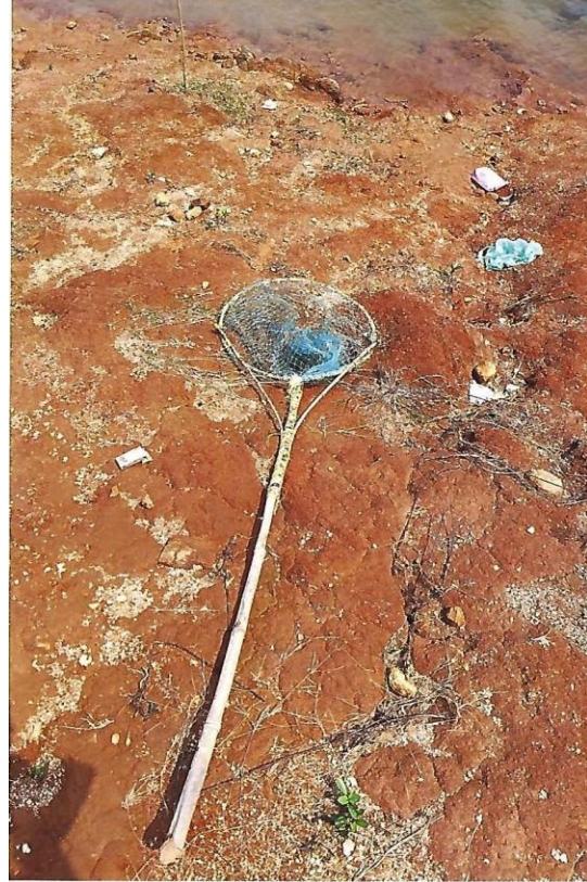
Figure 22 Bamboo pole handle