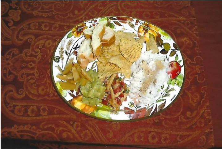
Figure 7 “Yum yum!”