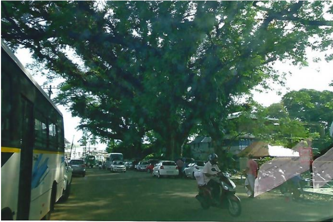
Figure 33 Brazilian trees planted by Portuguese over 400 years ago Kochi, Kerala, India