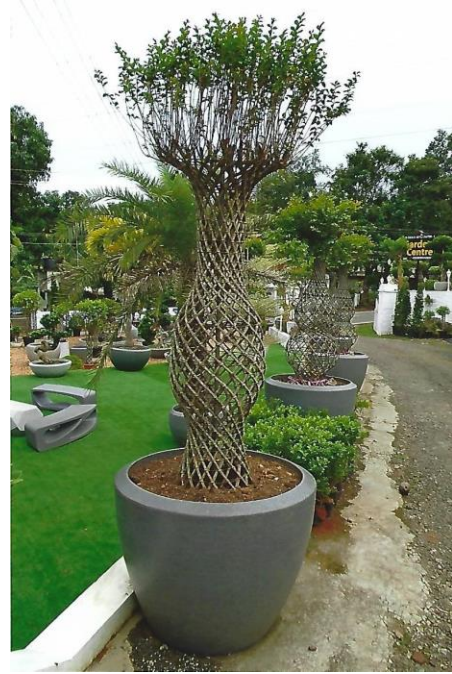
Figure 27 More beautiful topiaries