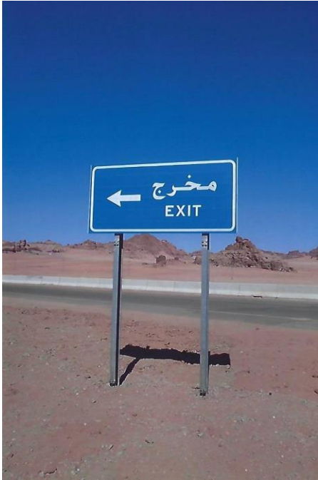
Figure 14 Saudi Arabian freeway exit sign.