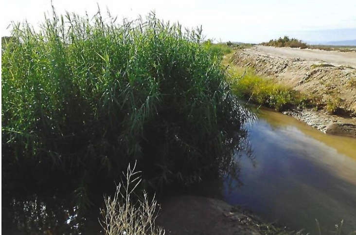
Figure 9 Native reed near Niland, Calif.

Not botanically classified as a bamboo but is possibly the closest native species to true bamboo that is found in southern California. Formerly more abundant and used for aft-shafts of arrows by native people this species is hard to find growing wild in our region except along the southeastern side of the Salton Sea. Was at one time growing even in the Mojave Desert. The native clone is not as aggressive a spreader as the European clone.