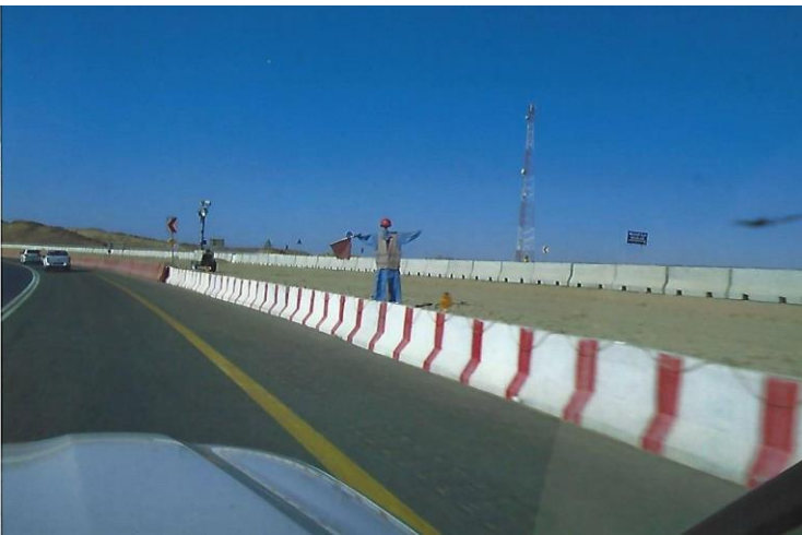
Figure 17 Saudi Arabian flag man.