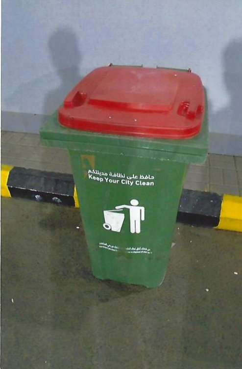
Figure 15 Saudi Arabian trash can.