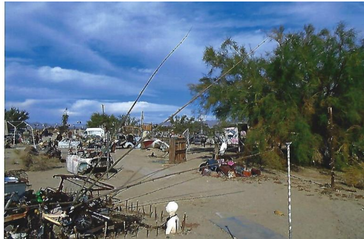
Figure 18 Bamboo poles used in artwork at East Jesus, Calif.

The editor visited the Kingdom of Saudi Arabia in October 2022 on a tourist visa. The relatively recent change to allow foreigners to visit KSA on tourist visas is gratefully acknowledged.