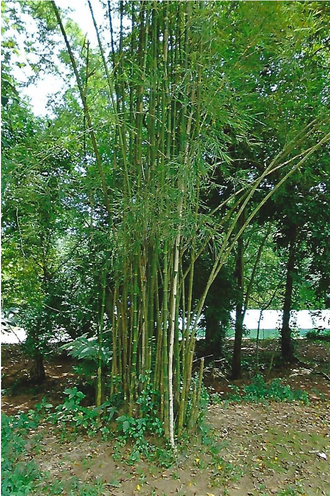
Figure 30 Bamboo at Hill Palace Museum