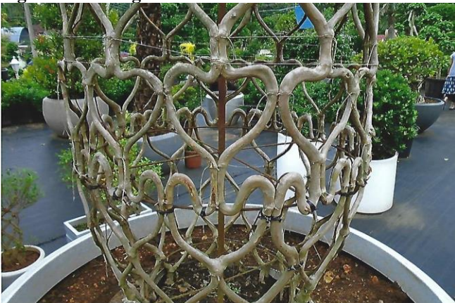
Figure 26 Exquisite topiary at Chris Bottle Crafters Garden Centre in Muvattupuzha, Kerala, India