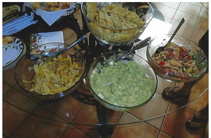
Figure 6 Bamboo ceviche dishes