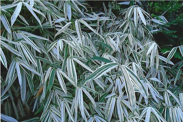
Figure 25 Variegated bamboo at Chris Bottle Crafters