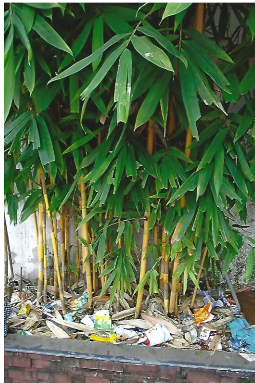
Figure 23 Bamboo at bus stop in Tripunithura