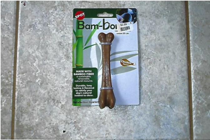
Figure 34 Dog bone made of bamboo