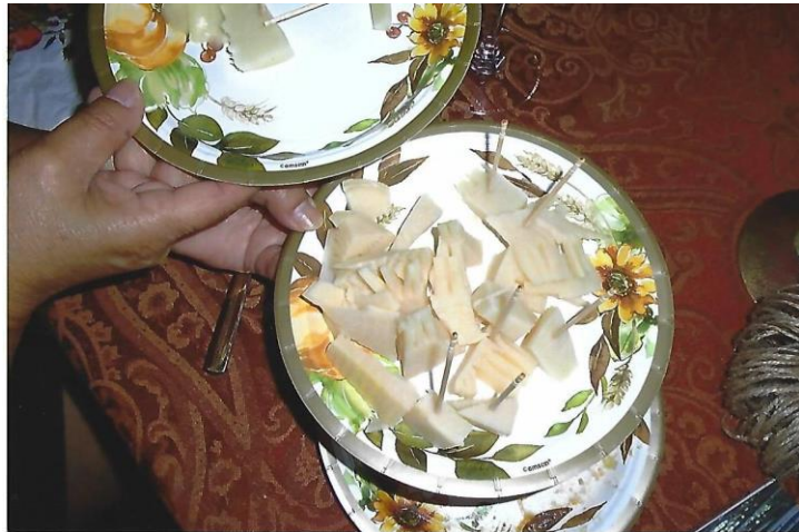
Figure 8 Bamboo shoots of commerce