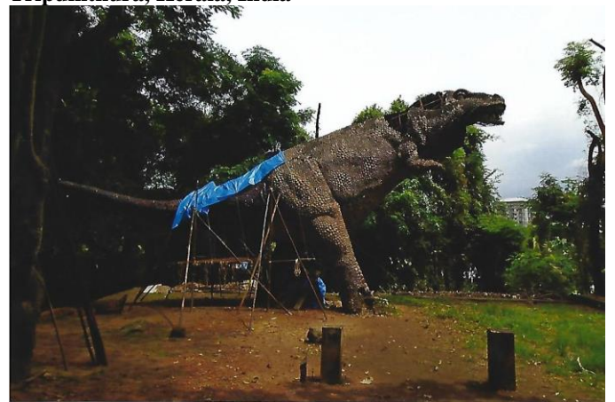
Figure 29 Dinosaur at Hill Palace Museum