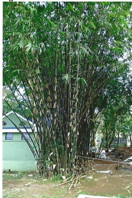
Figure 32 Clumping black bamboo at Subhash Bose Park

The editor visited Kerala State, India in October 2023. He saw many wonderful bamboos, spice plants, rubber trees, tea plantations, the location of the lost city of Muziris among many other interesting things, tried numerous curries and had a great time.