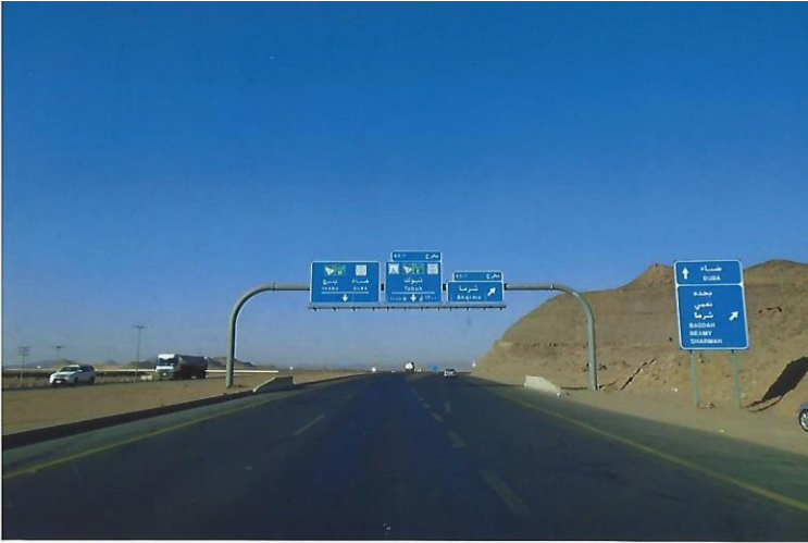
Figure 16 Saudi Arabian freeway signs.

Slab City located near Niland, California, is well known for its community of artists. In addition to the 1970s hippie vibe the area also has Salvation Mountain and East Jesus.