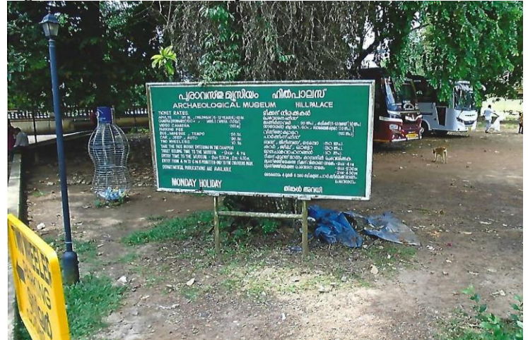
Figure 28 Entrance sign for Hill Palace Museum, Tripunithura, Kerala, India