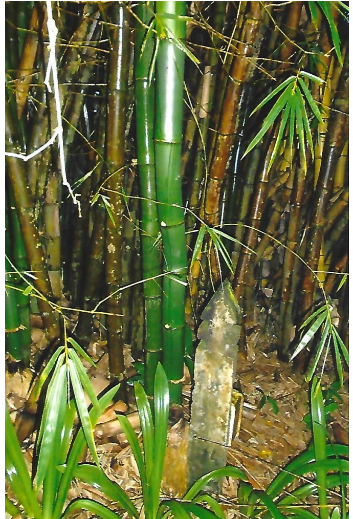
Figure 31 Bamboo in Kunnathunadu, Kerala, India