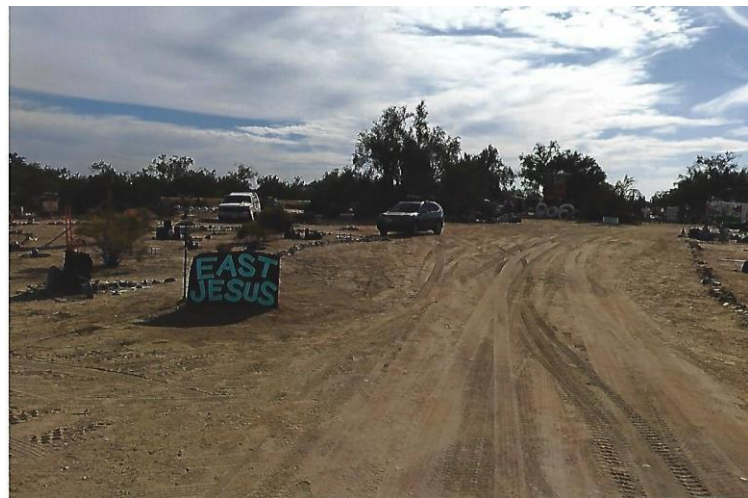
Figure 19 Art enclave of East Jesus, Calif.