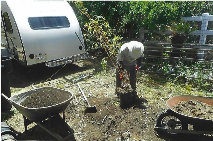
Figure 3 Dany potting bamboo division