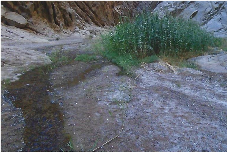
Figure 12 Stream and reeds at Wadi Tayyb-Esm, Saudi Arabia October 2022.