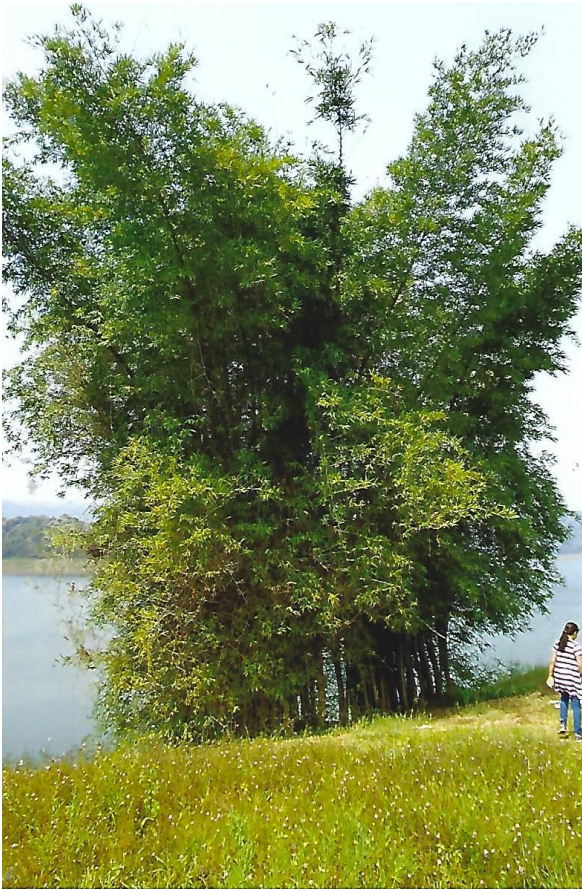
Figure 20 Bamboo at Idukki Reservoir