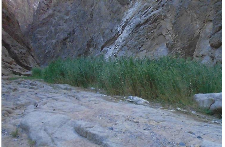
Figure 11 Reeds growing at Wadi Tayyb-Esm, Saudi Arabia October 2022.