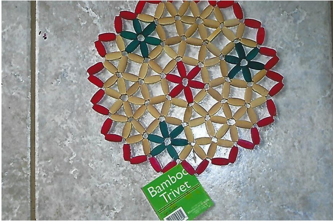
Figure 35 Bamboo Hot Pad