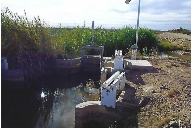
Figure 10 Irrigation canal near Niland, Calif.