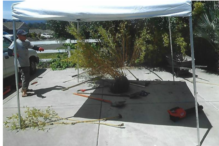
Figure 1 Clump of B.m. 'Alphonse Karr'